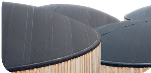
Biolene - expandable gas storage