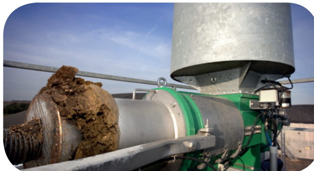
Quetschprofi - the separator for slurry and digestate