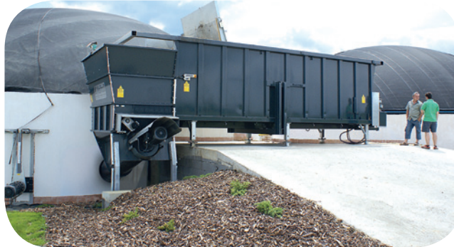
Vielfrass solid material feeder with 50 m² dosing unit and Biolene gasstorage

On the basis of this experience, we have developed purpose-built components and matched them with one another in our biogas plant to provide high quality complete plants. In designing and fabricating these components we give priority to high Quality, Robust Construction and high level of energy efficiency. The components have proven themselves for many years in use with various feed stocks such as grass, maize, farm manure etc. Our key components – Biolene, Paddelgigant and Vielfrass – have set standards in terms of stability, reliability, and energy efficiency.