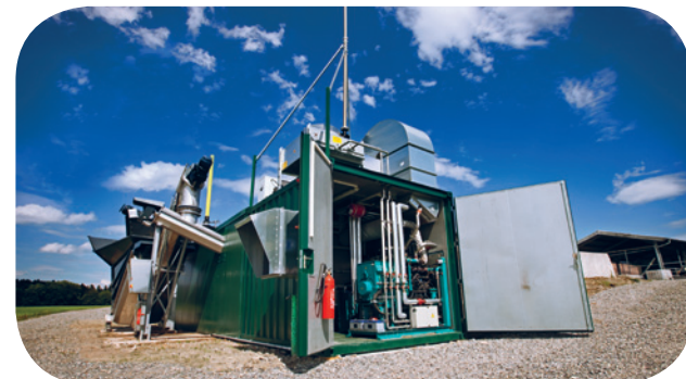
Güllewerk – the first biogas plant in a container comes on a trailer: unload and its ready to go!