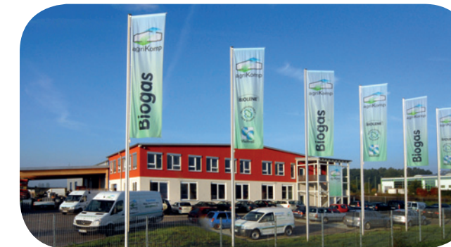
agriKomp headquarters – Merkendorf / Germany