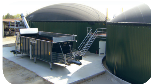
agriKompakt – modular biogas plant means fast construction time and affordable price