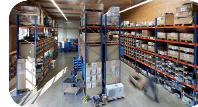
A large stock for standard parts and spare parts guarantee fast delivery

A high level of confidence and high quality shapes the success of each project for our customers. This strong co-operation will remain after completion, insuring customer support and service for years of guaranteed stable and reliably working biogas plant for you.