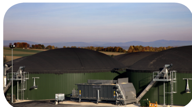
Individual biogas plants – designed for your special needs