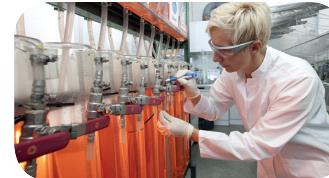
Ongoing research and development for better biogas production