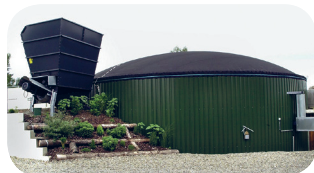
Individual biogas plants – from 50 kW to 2 MW and larger