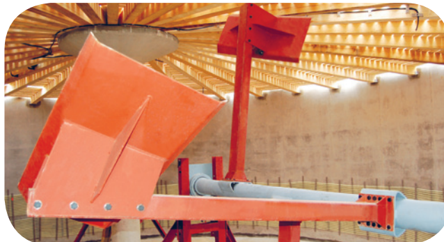
Paddelgigant - the agitator system from agriKomp for all renewable feedstocks