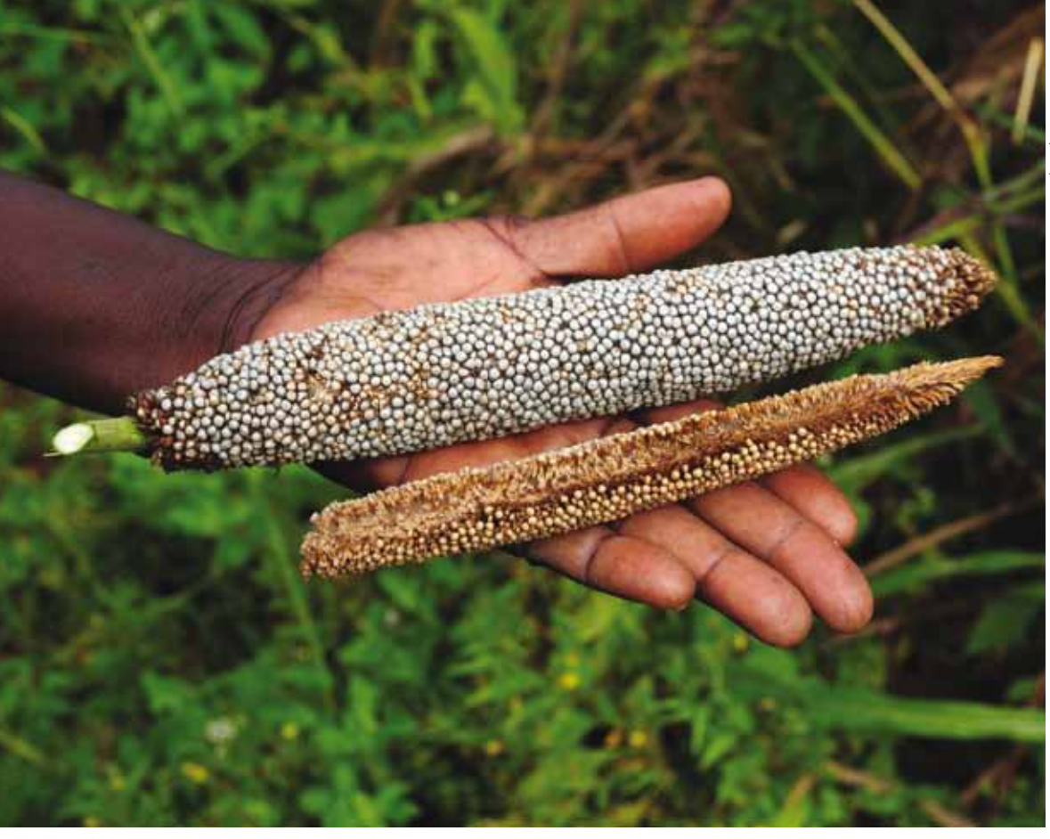
Comparison of good (top) and bad millet yields, in Ghana's Upper West Region, which has suffered failed rains and rising temperatures. Millet is a highly nutritious and resilient crop but is still susceptible to climate stresses.

What is the overall nutritional profile of the food, and how many vitamins and minerals does it contain? Poor nutritional intakemicronutrients such as iron, zinc, folic acid and the vitamin complexes—in a diet that appears to provide sufficient calories is often called the "hidden hunger."