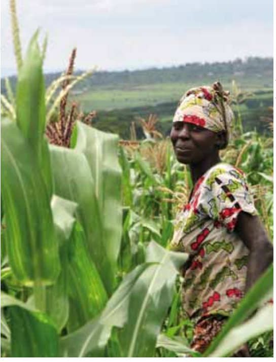
Maize is not well-suited for changes in growing conditions—specifically, higher average temperatures.

According to the United Nations Food and Agriculture Organization (FAO), more than half of the calories consumed globally come from these three crops.<sup>12</sup> But maize, wheat and rice production will be severely challenged by climate change. In some places, it may be possible to overcome the challenges by breeding more resilient varieties, such as those that can withstand high heat, drought or flooding. In other areas, adaptation strategies could involve replacing