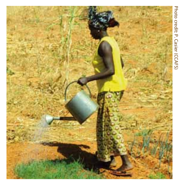
Developing sustainable water management strategies will be critical for climate change adaptation.

Options are available but there are no easy answers.